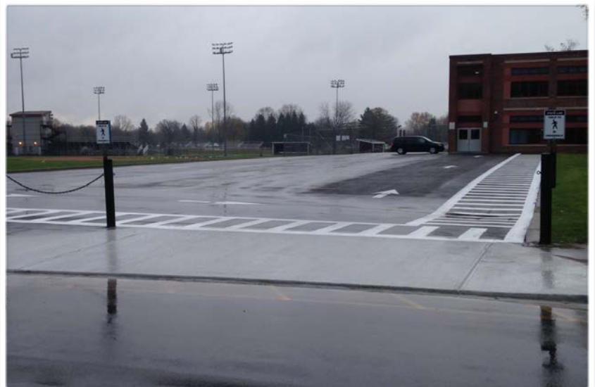
New parent parking lot at Roberts Street campus.