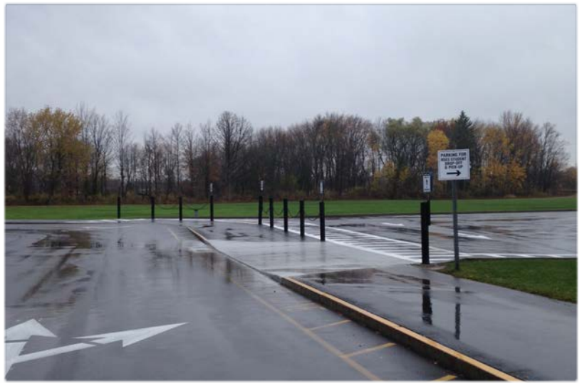
New parent parking lot entrance at Roberts Street campus.